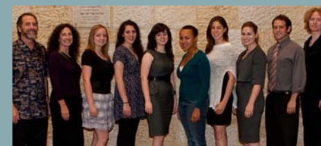
Scholarship Recipients and donors at the June reception.

The JVS Scholarship Fund, which to date has awarded over $4.5 million to Jewish students in financial need, held a special reception at Sinai